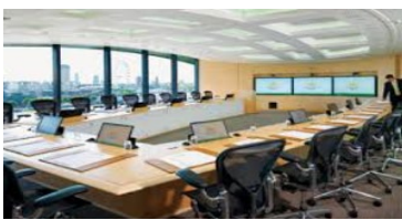
AUDIO VISUAL DESIGN

Immersive Concepts is dedicated not only to the resolution of complex problems but also to providing quality and timely service. While Immersive Concepts offers a broad range of services, we deliver just one standard performance: Excellence.